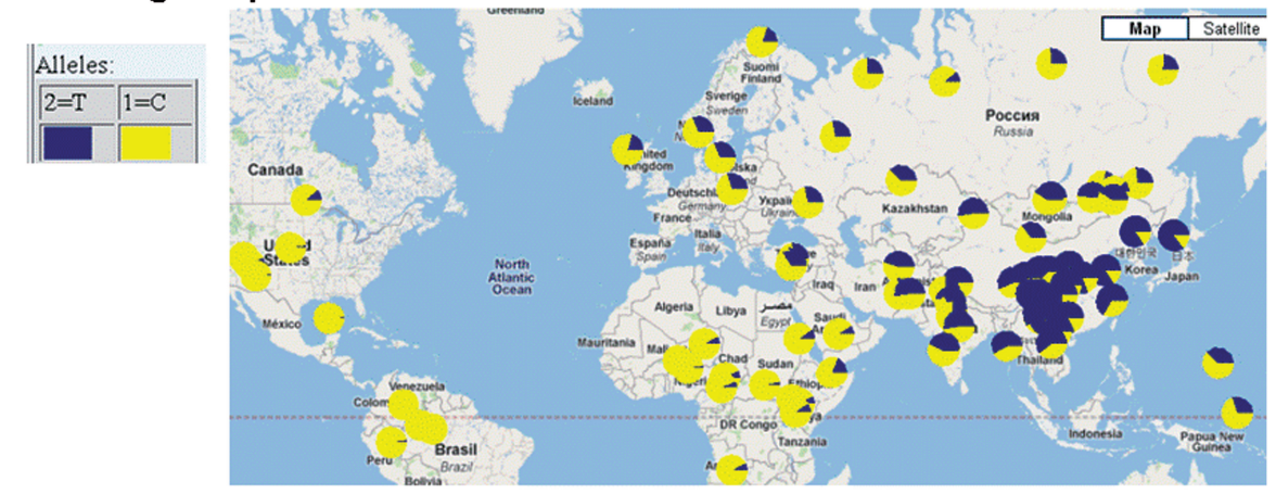
Figure 2. Different allele frequency display formats for rs2066701 of ADHIB gene.

annotating ALFRED populations. ALFRED curators are responsible for comparing between different wiki update versions and adding relevant information to the population descriptions in ALFRED. We invite ALFRED users to participate in this effort of population annotation. Users are required to create an account and log in to be able to edit the ALFRED wiki pages. Contact us using our feedback function on the ALFRED home page to create an account.